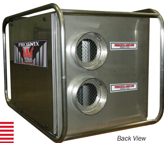
Back View Dual 8" Process Outlets