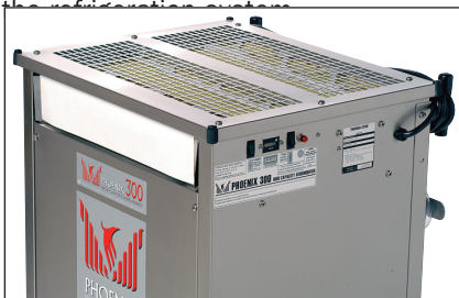
Integrated cord and drain hose management

Phoenix dehumidifiers feature significant air filtration. Even the standard 57% MERV-8 filters remove over 90% of airborne particles. This filtration dramatically improves the air quality in the areas being dried and assures continued optimal performance of the refrigeration system.