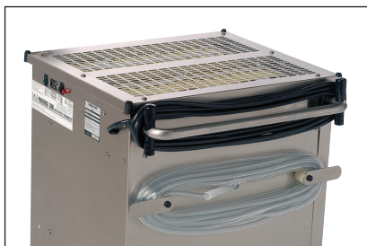
Easy access controls, integrated filtration and stainless steel construction