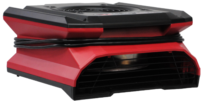
Phoenix AirMax PN 4035000

The Phoenix AirMax is the safest fan in its class providing a quality GFCI convenience receptacle that protects not only connected loads, but onboard components as well. This is unlike competing fans that require external GFCI protection. In addition, where competitors position high voltage electrical connections low to the floor, the leading edge design of the Phoenix AirMax allows these connections to be located more than 4 times the minimum required height. The Phoenix AirMax is built to keep our customers, and their customers, safe.