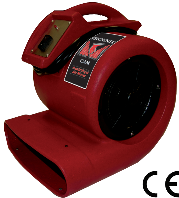
Phoenix Centrifugal Air Mover 50Hz PN 4027620