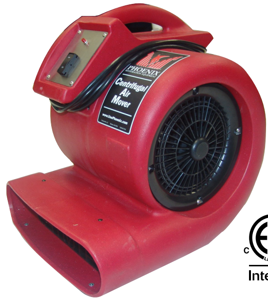
Phoenix Centrifugal Air Mover PN 4027508