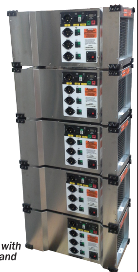
Stack up to 6 units with a strap for storage and transportation