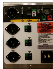
4 - 12 amp circuits Up to 20,000 BTU's