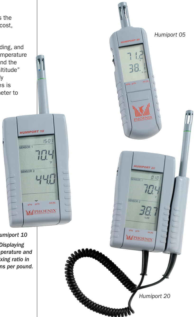
Humiport 10 Displaying temperature and mixing ratio in grains per pound.