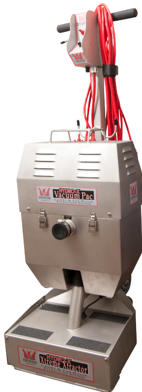
Xtreme Xtractor with Hydro-X Vacuum Pac

The patented Hydro-X Xtreme Xtractor has been designed to pull more water from carpet and pad than any other extraction tool on the market today.