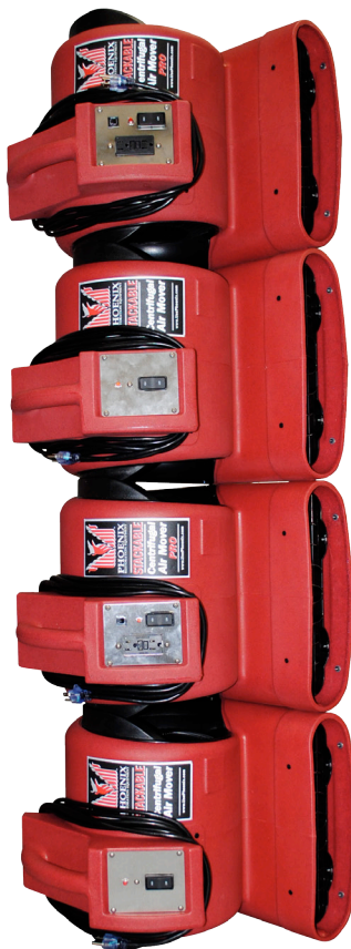
PNs 4030980 and 4030990 are pictured to demonstrate maximum stackability.

Place your first fan on the floor, motor side down. Pick up your second fan and orient it above the first fan. Engage the alignment nubs on the side of both snouts. Rotate the second fan down into position until the grills engage. If the fans will be transported while stacked, they must be securely strapped into position.