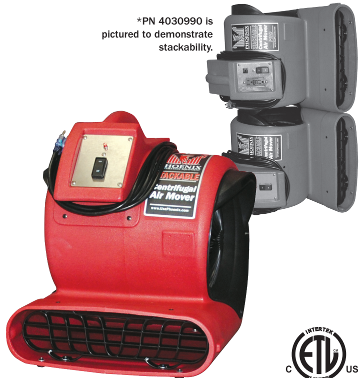
Phoenix Stackable Centrifugal Air Mover PN 4030980

*PN 4030990 is pictured to demonstrate stackability.