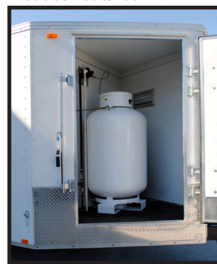
120 Gallon Propane Cylinder included with the Phoenix 1800 Desiccant System